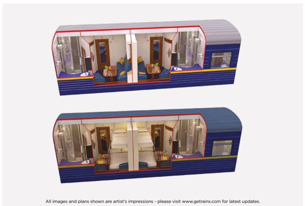
All images and plans shown are artist's impressions - please visit www.getrains.com for latest updates.