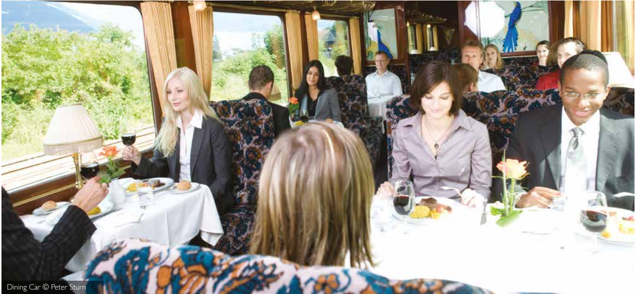
Dining Car